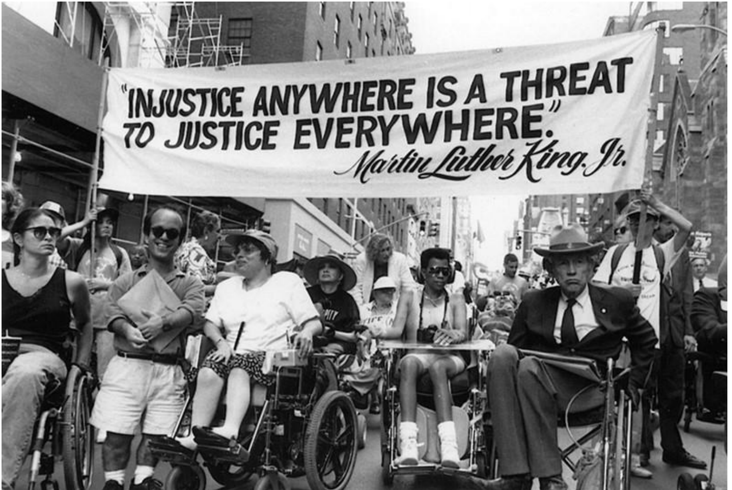
IMAGE OF 1993 DISABILITY INDEPENDENCE PARADE CHOSEN IN HONOR OF JUDY HEUMANN, WHO PASSED AWAY ON MARCH 4, 2023. HTTPS://JUDITHHEUMANN.COM